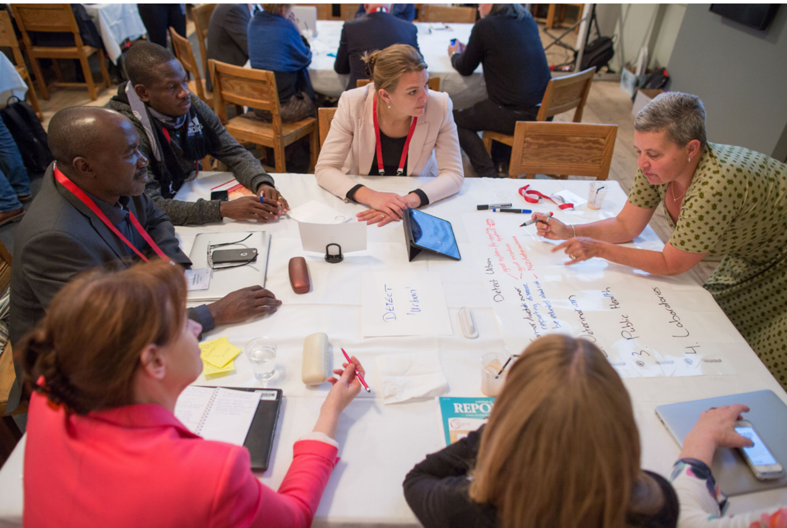
Mapping the many different public and private actors in urban animal keeping and food value chains help better understand future disease risks. Here the participants in the workshop on Zoonotic Disease Management are deeply engaged in the task.

way that does not jeopardise the final analytical results; thus a good infrastructure is a prerequisite for accurate detection of zoonotic diseases in rural areas. It is not always obvious who the key actors for infrastructure are. They probably range from, for example, local district veterinary/medical organisations, to delivery services and national politicians.