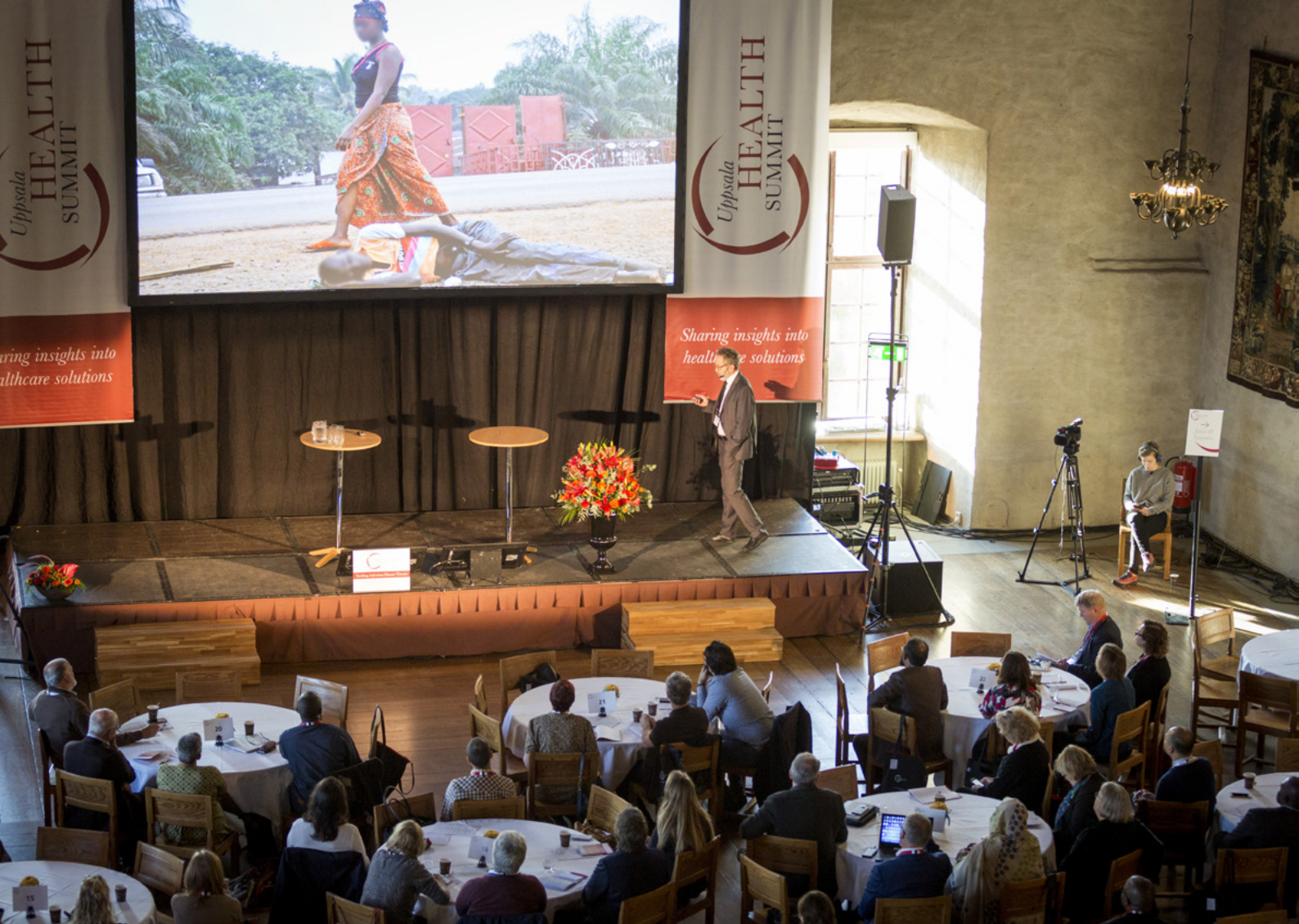
180 selected decision-makers, opinion-builders and experts from 39 countries met at Uppsala Castle, Sweden, in October 2017, to discuss how to tackle the many aspects of infectious disease threats that the world face with a One Health approach.